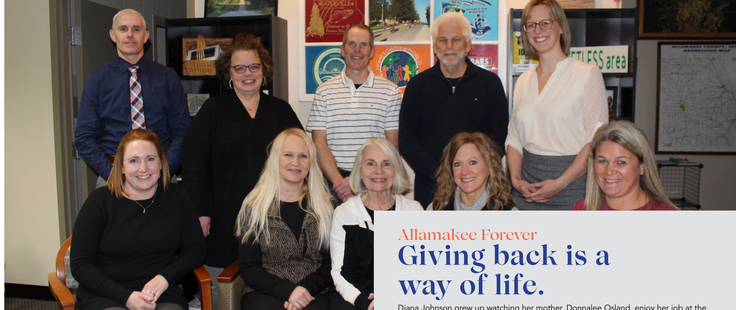
Community Foundation board members, leaders of the Allamakee Forever campaign