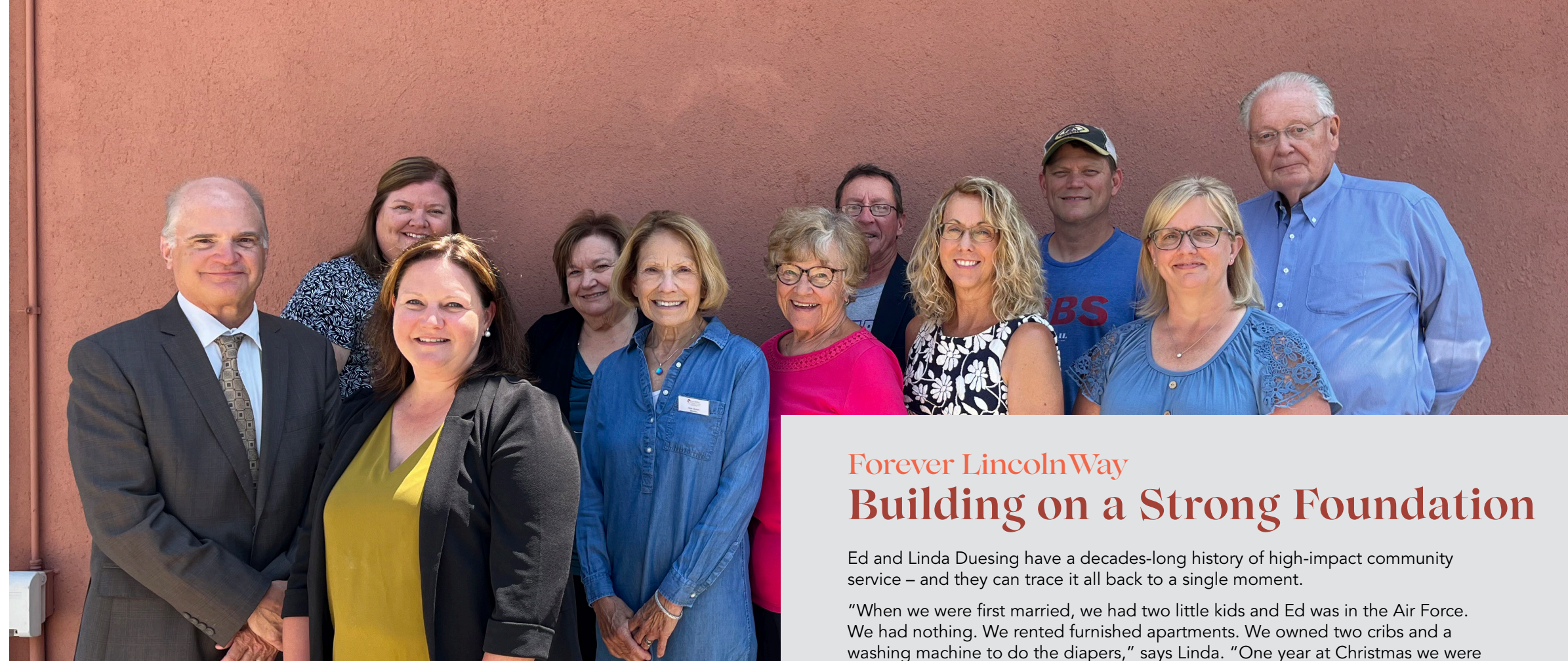
LincolnWay Community Foundation board members, leaders of the Forever LincolnWay campaign